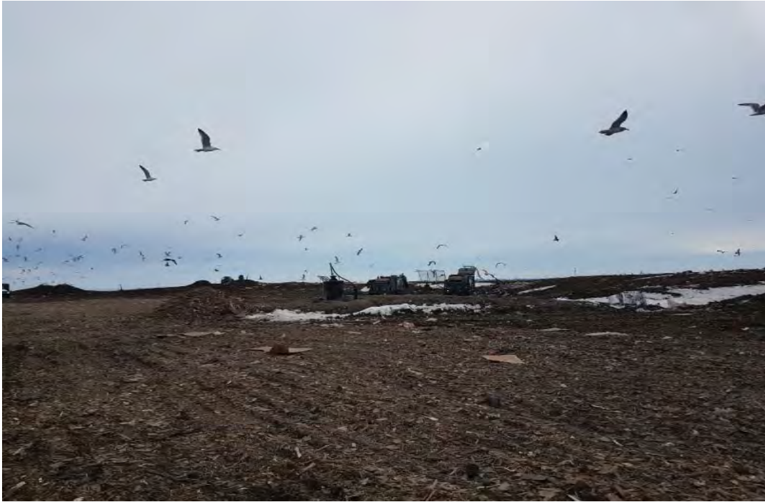
View East across active area