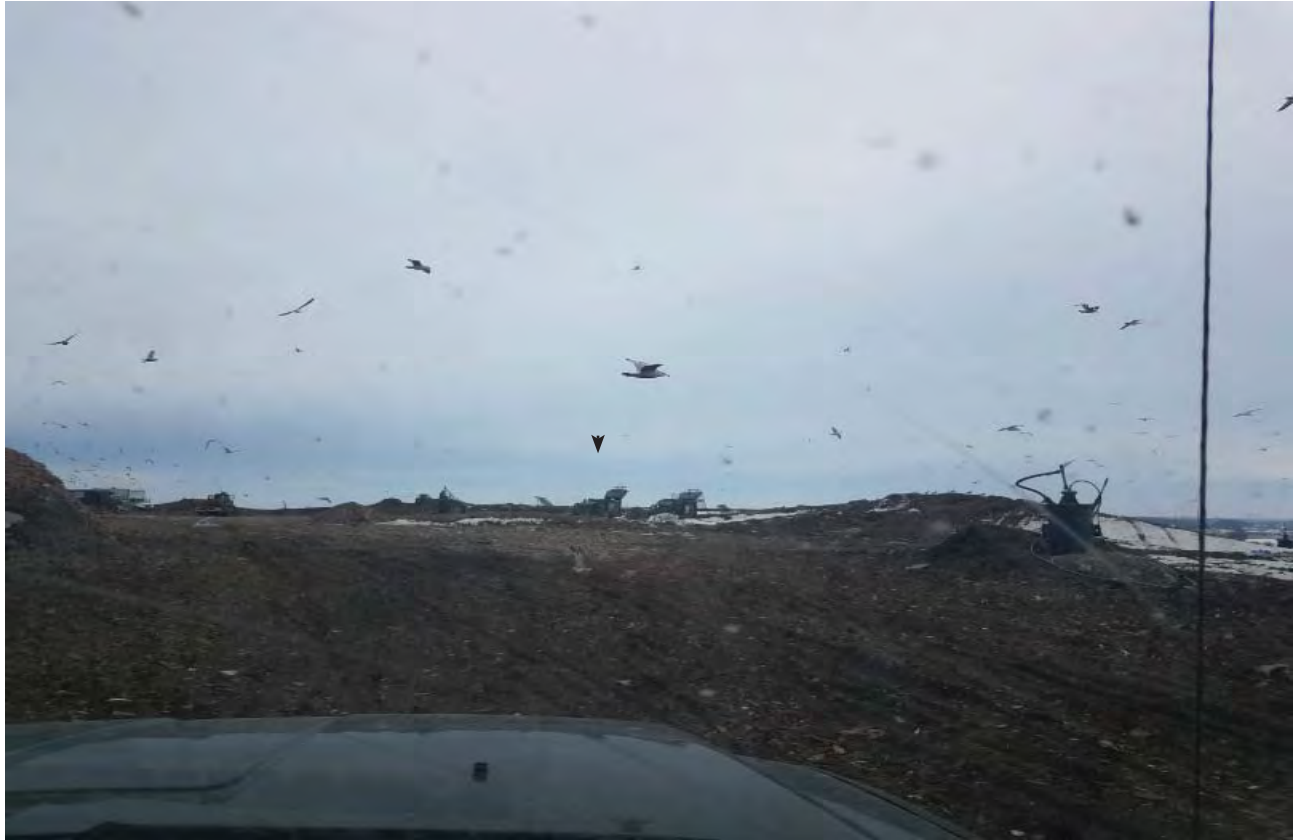
Working face wrapped with alternative cover materials