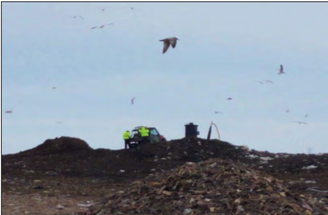
Technicians working on Well in Phase 6