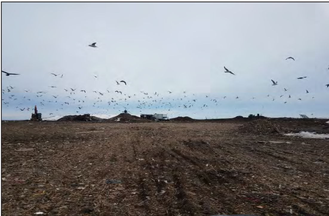
View to the South from access road