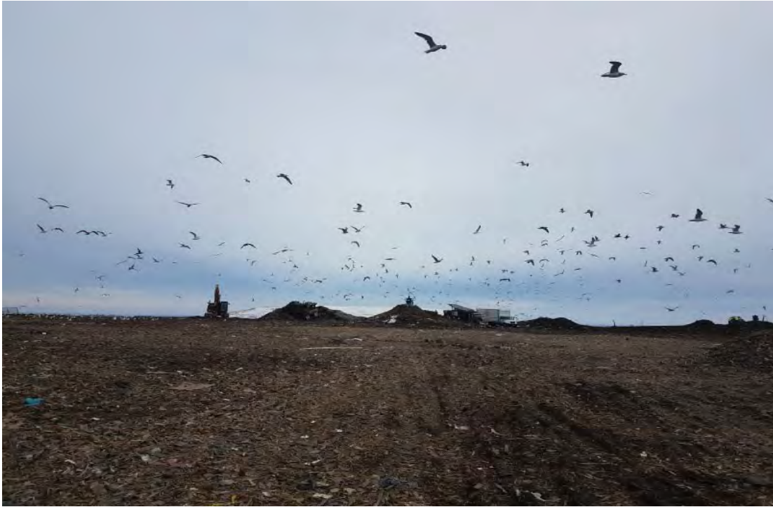
View across Phases 7 to 5